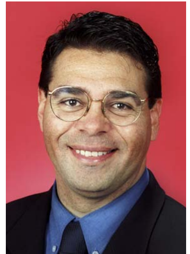
Senator Aden Ridgway

www.aph.gov.au/Senate/committee/freetrade_ctte/index.htm