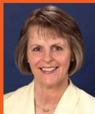
Lyn Allison Leader & Senator for Victoria