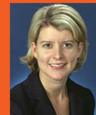
Natasha Stott Despoja Senator for South Australia