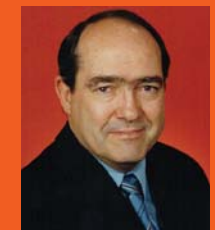
Andrew Murray Senator for Western Australia