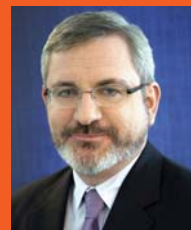
Andrew Bartlett Senator for Queensland