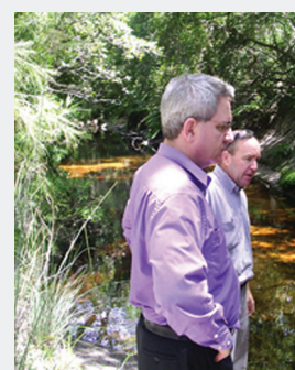
Caption: Senator Bartlett inspecting a waterway.

See www.aph.gov.au/Senate/committee/ecita_ctte/nationalparks/index.htm for more.